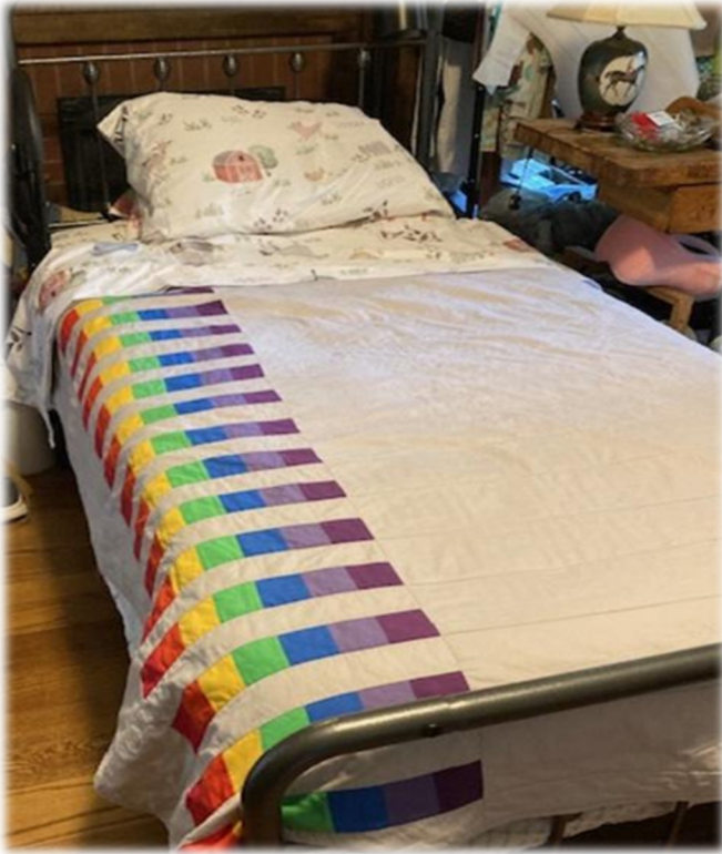
Comfort Quilt by Debbie Barnett. The pattern is a variation of "In the Throne Room". Rainbow colored 2 1/2" strips are sewn into strata, then cut and assembled to create the design running the length of the quilt.